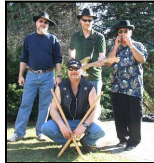
Jimmy G and the Capitols

11:30 a.m. – 1:30 p.m. Children/Youth/Young Adults featuring Mime-n-Motion Dance for Life D.A.N.C.E. Inc Mustard Seed Kids Essay Contest Winners