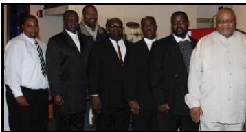
Galilee Male Chorus

Celebrate the 6th Annual Michigan Juneteenth Freedom Day